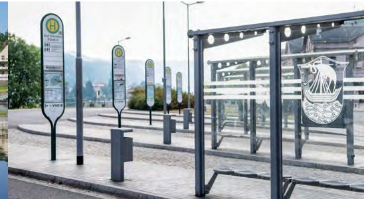
Bus stops at Nationalpark-Bahnhof Bad Schandau

Exit the train, board the S-Bahn (commuter train) and watch as the city metamorphoses into National Park outside the train window. The historic Kirnitzschtalbahn even takes you right into the heart of the nature reserve. We have compiled a number of gentle modes of travel to ensure a holiday with genuine deceleration.