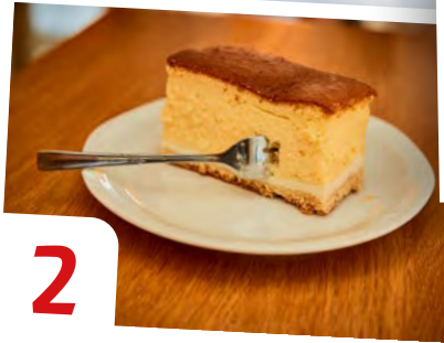
Enjoy a slice of Eierschecke (regional layered cheesecake) in the historic town centre of Pirna.