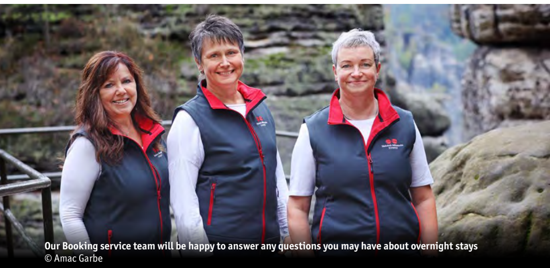
Our Booking service team will be happy to answer any questions you may have about overnight stays

We can also help you decide on suitable accommodation: just write us an email, and together we will find the perfect place for you to stay on your trip through beautiful Saxon Switzerland.