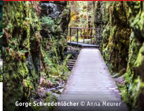
Gorge Schwedenlöcher