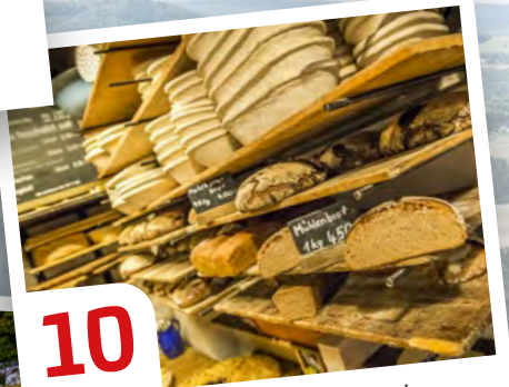
Try regional products i.e. in the organic village of Schmilka