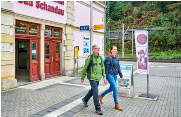
At Nationalpark-Bahnhof Bad Schandau