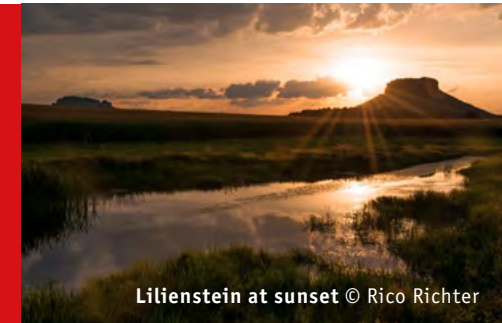
Lilienstein at sunset

The distinctive table mountain Lilienstein is the landmark of the national park Saxon Switzerland. Climbing this colossus is an exhausting but also a rewarding hiking adventure.