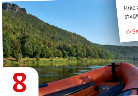
Explore the Elbe Valley by rubber dinghy