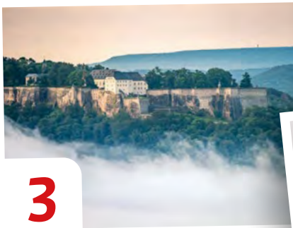
Conquer the castle Königstein on foot