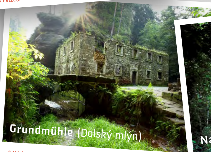
Grundmühle (Dolský mlýn)