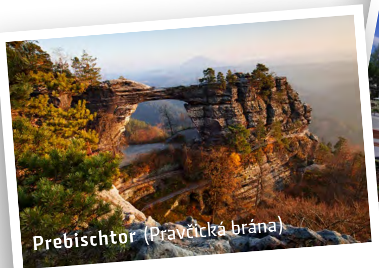
Prebischtor (Pravčická brána)

The National Park railway U28 links the two regions of Saxon and Bohemian Switzerland. It goes from Děčín via Bad Schandau, Sebnitz, Dolní Poustevna and Mikulášovice dolní nádr. to Rumburk. The transborder service thus connects destinations along the Elbe Valley, the Sebnitz Valley and the so-called Schluckenauer Zipfel.