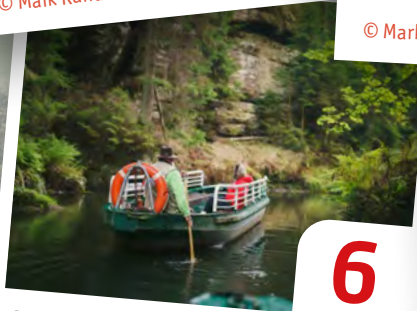
Enjoy pure relaxation on a boat trip through the Hinterhermsdorf upper lock (Obere Schleuse)