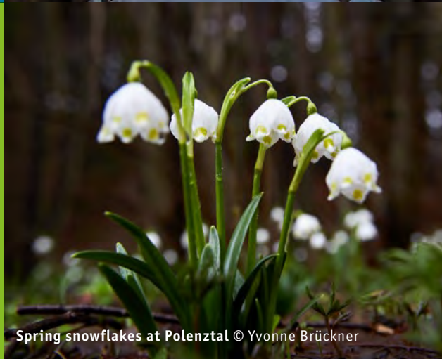
Spring snowflakes at Polenztal

Lush meadows and a newly formed, dense leaf canopy – a green oasis of calm. After the dark winter days, the first warm rays of sun allow the region to radiate. Perfect for soaking up some much-needed vitamin D on long hikes.