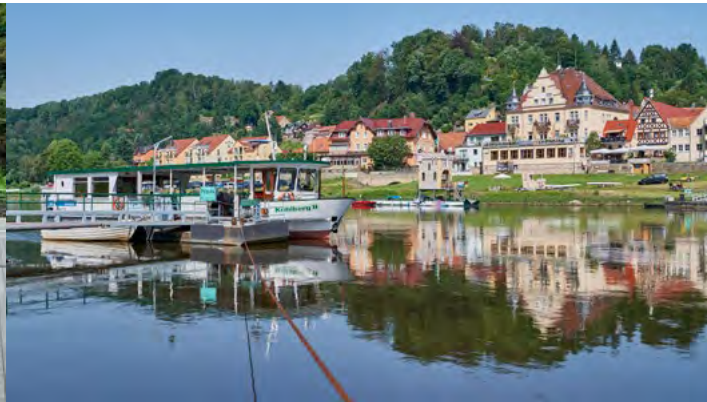
The Hiking boat docks on its way to Hřensko