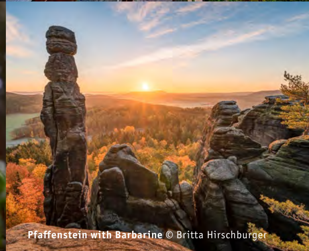
Pfaffenstein with Barbarine