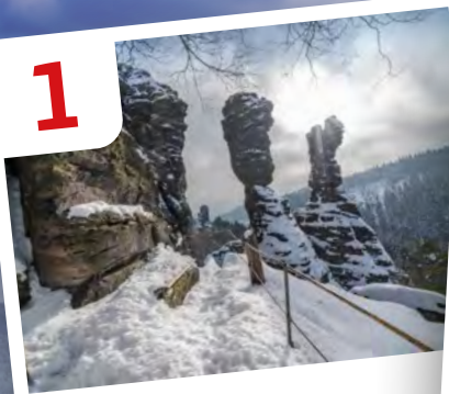
Marvel at the Herkulesssäulen (rock formation Pillars of Hercules)