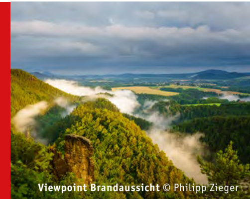
Viewpoint Brandaussicht

This hiking trail will take you to the Brand viewpoint, the so-called “balcony” of Saxon Switzerland. Here, the landscape ends in a sheer drop, and you can look down into the deep Polenz Valley. The location is exposed, and views down into the canyon-like valley and into the landscape beyond are truly spectacular.