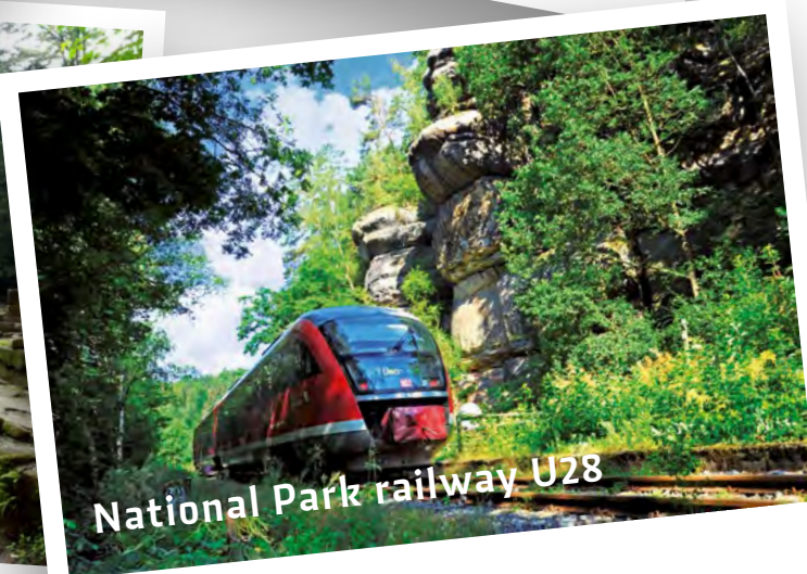
National Park railway U28