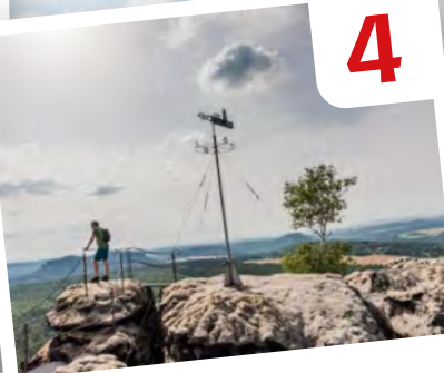
Hike at least one of the eight Malerweg stages.