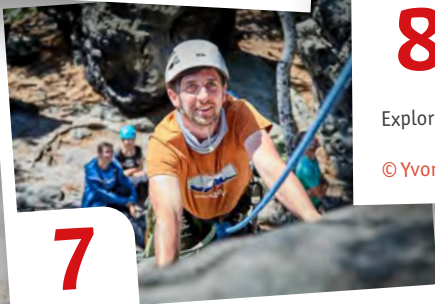
Climb a mountain (beginners' climbing courses are available)