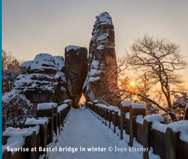
Sunrise at Bastei bridge in winter

The cosiest of the four seasons wraps the rocky landscape in a thick blanket of snow. Everything looks idyllic and magical. An atmosphere that warms the heart. The festive season in the Elbe Sandstone Mountains is full of fascinating traditions and is a time to relax.