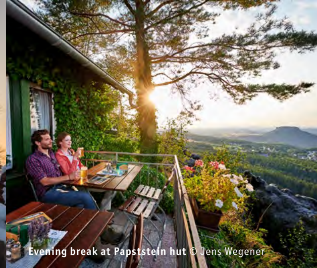
Evening break at Papstein hut