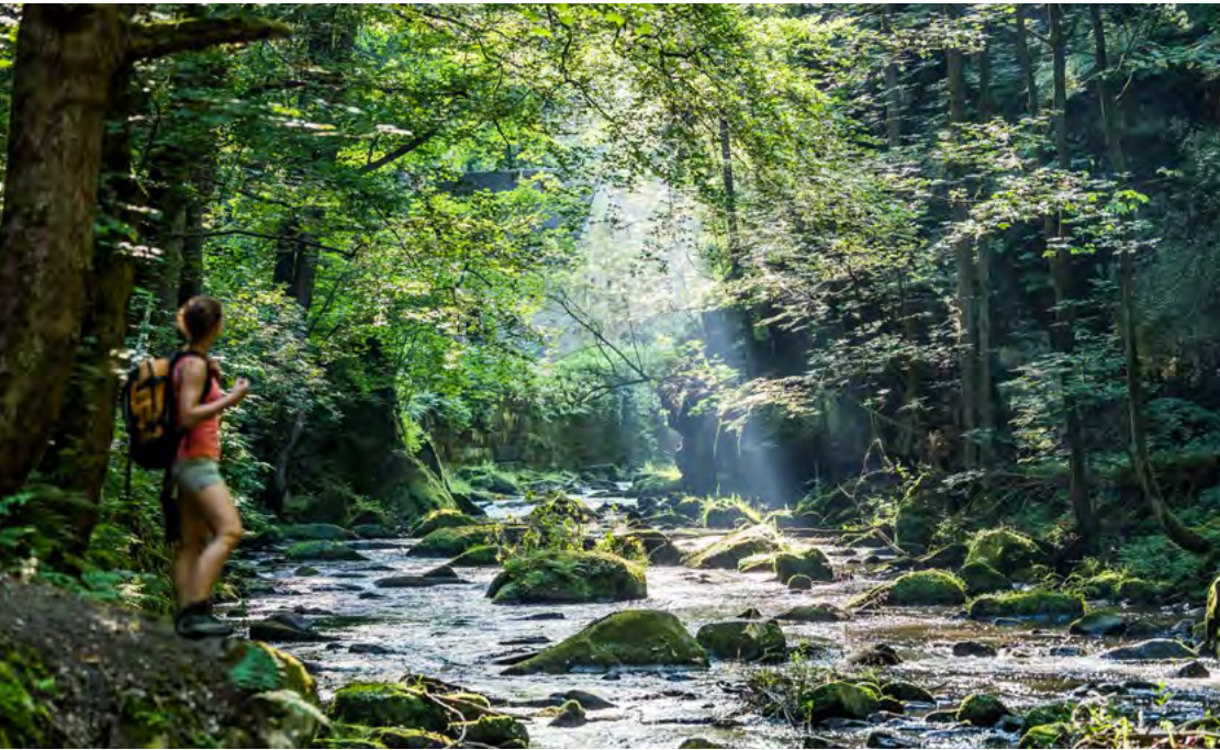
Malerweg trail, stage 1

When you travel to Saxon Switzerland, you simply have to go hiking! Discovering the region's beauty spots on foot has a long tradition and is still worthwhile today.